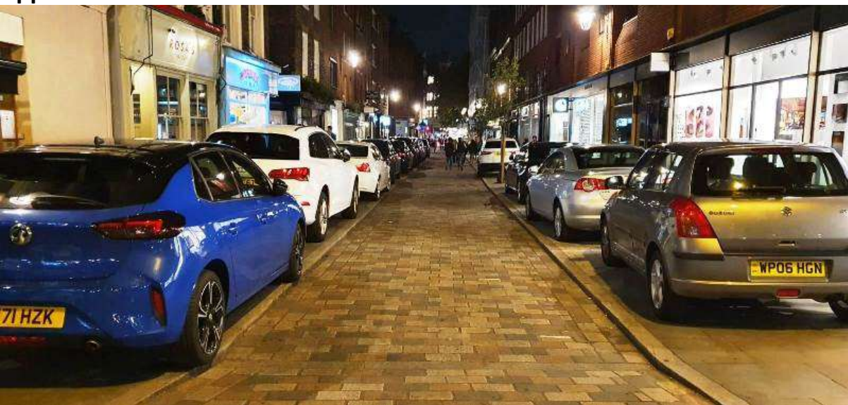
Earlham Street West footway parking.

There is little point in relying on non-existent enforcement and facts need to be confronted. The Trust proposes that the narrow Seven Dials bollard be installed on NAL sockets, at the minimum distance to prevent the above from occurring. They also serve the purpose of denoting 'Seven Dials' and as with street furniture in the past, are decorative. Given the increased pedestrian flows from the Elisabeth Line it is essential that footway widening serves to accommodate pedestrians and not parking, planters and al fresco dining.